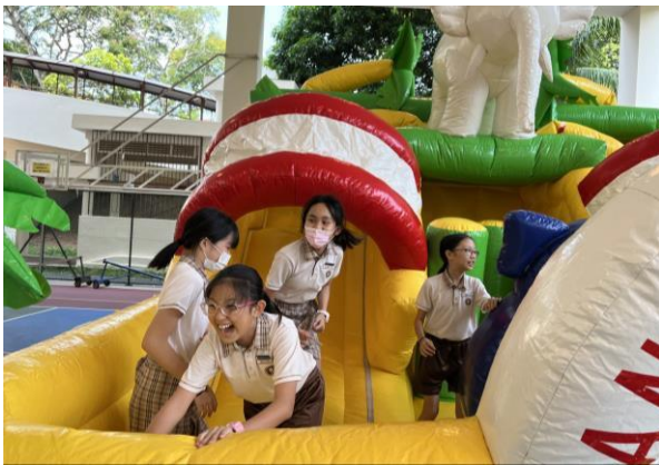
Enjoying themselves in the bouncy castle

Children's Day 2023 was a wonderful and memorable event, thanks to the collective efforts of our school community, leaving everyone looking forward to next year's celebration.