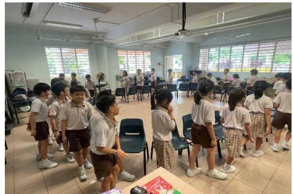
Playing musical chairs together as a class