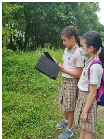
Students taking photos of the plants along the nature trail in the Rail Corridor.