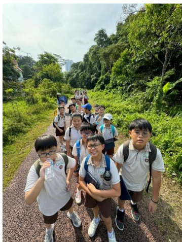
Students taking a short break to hydrate and pose for a group photo