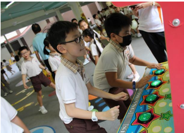
Teaming up to earn more points