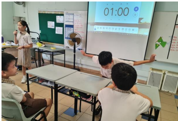
Student-led classroom activity