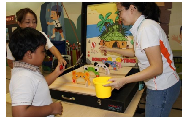
Playing at the different game booths