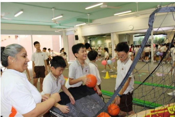
Trying to shoot the basketball into the hoop!