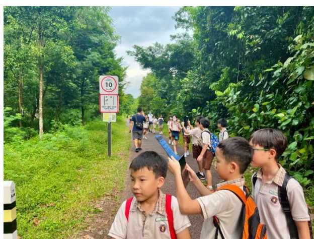
Students taking pictures of signages with numbers as part of the mathematics task