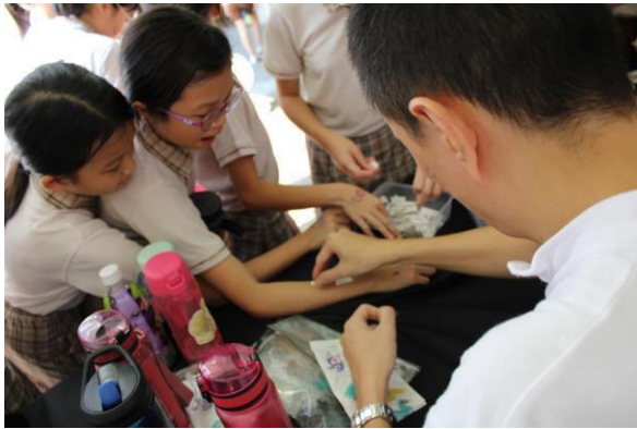
Choosing their tattoo stickers