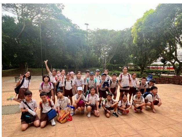
Group photos to mark the checkpoints along the walk