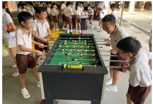
An intense game of Table Football