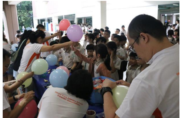
Eagerly waiting to receive their balloons