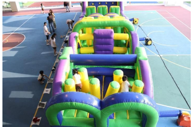
Who will complete the obstacle course first?