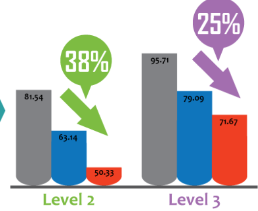
Figures in the columns refer to average score